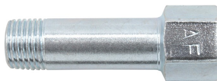
Long M&F Adaptor