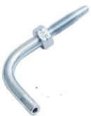
Hose End 90°