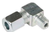
Male Elbow Connector