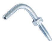
Hose End 90°