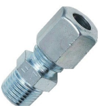
Male Connector Straight