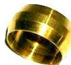
6mm Double Coned Olive