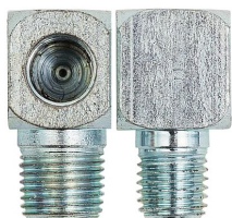
90° Male / Female Elbow