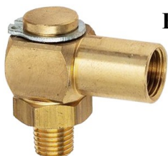
Brass 90° Male / Female Banjo